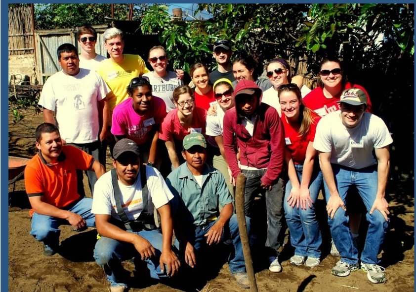
Our LCM Team pictured with the masons and Construa Casa Staff

Although many of us had travelled abroad, this travel experience was definitely more meaningful than the previous ones we'd had. It was a joy to explore Antigua, a beautiful colonial city! We walked along cobblestone streets, haggled for fresh produce in the Mercado, admired the brightly colored buildings, and listened to live music. We even tried our hand at making traditional Guatemalan foods like salsa roja, pepian, plantains, and chili rellenos.