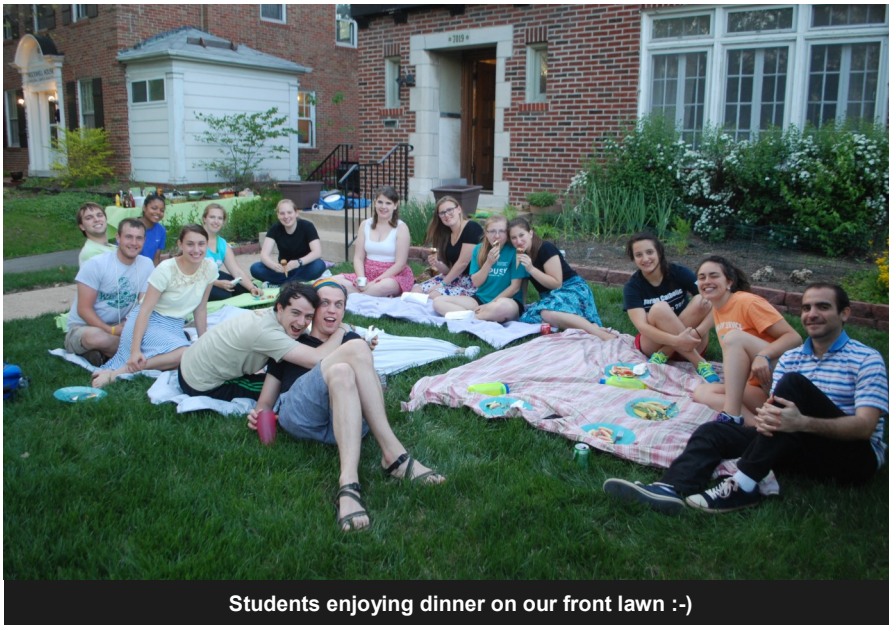
Students enjoying dinner on our front lawn :-)