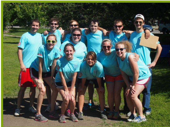
The "Blessed Ballerz" LCM Summer Kickball Team